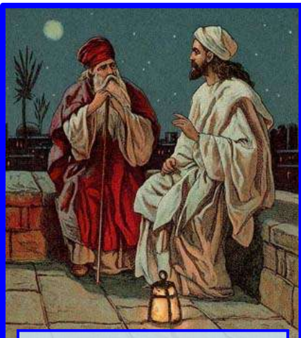
Jesus & Nicodemus

Since Jehovah's Witnesses find themselves in exactly the same type of situation (needing, yes even requiring 'Messiah-like' spiritual " liberation ") as did the Jewish Nation of Jesus' day, we've noticed many, many similarities between the two, namely the Jewish Nation of Jesus' day, led by the wicked Pharisees and religious leaders of that time, and the modern-day spiritual leadership of Jehovah's Witnesses and the powerful hold they have upon the "skinned & thrown about" sheep of the flock we refer to as "Jehovah's Witnesses." ( Matthew 9:36 ) Indeed, we find just as in Jesus' day, these religious leaders wish to "keep the people down" by " taking away the key of knowledge " as Jesus said, yes, keeping precious "accurate knowledge" away from the people. (Luke 11:52; John 17:3 NWT) We today know, Jesus faced many hardships in trying to spiritually reach the bewildered people of his time, is that not so? Yes, it was quite difficult for Jesus to do this. In many instances, the bible tells us even, "stealth" or "secrecy" was employed by Jesus' disciples to overcome this sad situation. -- See John 3:2 ; John 19:38 .