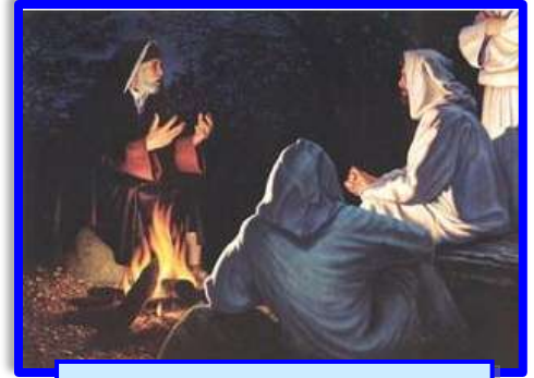
The Word of God taught in secret, "in the night."

Therefore, with such wicked ones, wicked leaders of the nation, it is no surprise that such a situation exists today, as wicked opponents of the YORWW wish to bring us down, given the possibility of a sincere person (from among Jehovah's Witnesses) could want to be a "secret disciple" of our movement too. However, that possible danger has been avoided completely, using our method. Yes, a sincere Jehovah's Witness, could "secretly," in the complete privacy of his/her own home, in his "basement" even, could HAVE CHURCH, HAVE ASSOCIATION and SPIRITUAL EDIFICATION , yes, "incite to love and fine works" even, without anyone knowing. In fact, didn't Jesus actually have "secret" disciples, who came to him ... only " IN THE NIGHT? " -- See Luke 12:3; John 3:2; John 19:38; Hebrews 10:24, 25.