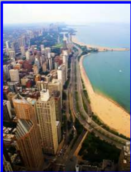
Aerial view of Kingston, Jamaica

So then, the YORWW's way, is the best way to handle all such situations, using the INTERNET CHURCH method. Think about it!