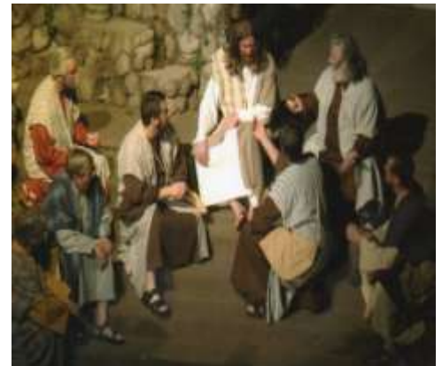
Secret Disciples Taught During Evening Time.

For instance, if a secretive Jehovah's Witness was observed going to secret meetings of the YORWW at perhaps, a certain physical location, couldn't that person be MONITORED ... isn't that true? Yes, someone could watch that person, leave his home and follow that person to the designated point of destination, a known place or house of APOSTATES ... to attend secret meetings!!! Isn't that so??? Didn't Jesus himself, face the EXACT SAME SITUATION with the Pharisees wanting to expel any and all who wanted to give Jesus a listening ear? Even going to the point of sending secret "spies" to feign interest, so that they could somehow thwart Jesus' righteous ministry? And further, going so far as to threaten to expel anyone from the synogogue of the Jewish Nation, caught listening to Jesus ... didn't they do this? -- Luke 20:20; John 9:22; John 12:42; John 16:2