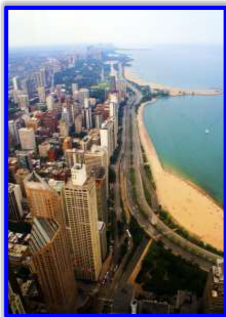
Aerial view of Kingston, Jamaica