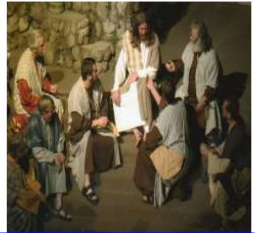
Secret Disciples Taught During Evening Time. (John 19:38)

of Jehovah's Witnesses...just like in Jesus' day. -- See John 9:22 ; John 12:42 .