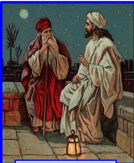
Jesus & Nicodemus (John 19:39)

Since Jehovah's Witnesses find themselves in exactly the same type of situation (needing, yes even requiring 'Messiah-like' spiritual " liberation ") as did the Jewish Nation of Jesus' day, we've noticed many, many similarities between the two, namely the Jewish Nation of Jesus' day, led by the wicked Pharisees and religious leaders of that time, and the modern-day spiritual leadership of Jehovah's Witnesses and the powerful hold they have upon the "skinned & thrown about" sheep of the flock we refer to as "Jehovah's Witnesses." ( Matthew 9:36 ) Indeed, we find just as in Jesus' day, these religious leaders wish to "keep the people down" by " taking away the key of knowledge " as Jesus said, yes, keeping precious "accurate knowledge" away from the people. (Luke 11:52; John 17:3 NWT) We today know, Jesus faced many hardships in trying to spiritually reach the bewildered people of his time, is that not so? Yes, it was quite difficult for Jesus to do this. In many instances, the bible tells us even, "stealth" or "secrecy" was employed by Jesus' disciples to overcome this sad situation. -- See John 3:2 ; John 19:38 .