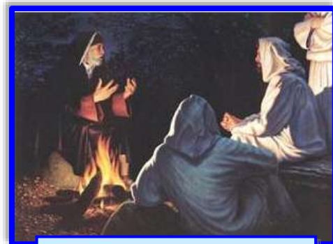
The Word of God taught in secret, "in the night." (John 19:38, 39)

Therefore, with such wicked ones, wicked leaders of the nation, it is no surprise that such a situation exists today, as wicked opponents of the YORWW wish to bring us down, given the possibility of a sincere person (from among Jehovah's Witnesses) could want to be a "secret disciple" of our movement too. However, that possible danger has been avoided completely, using our method. Yes, a sincere Jehovah's Witness, could "secretly," in the complete privacy of his/her own home, in his "basement" even, could HAVE CHURCH, HAVE ASSOCIATION and SPIRITUAL EDIFICATION , yes, "incite to love and fine works" even, without anyone knowing. In fact, didn't Jesus actually have "secret" disciples, who came to him ... only " IN THE NIGHT? " -- See Luke 12:3; John 3:2; John 19:38; Hebrews 10:24, 25.